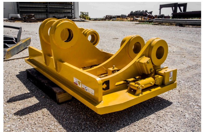
Caterpillar 990 Wheel Loader

Models can be setup with visibility window to increase operator visibility when handling large rocks and blocks.